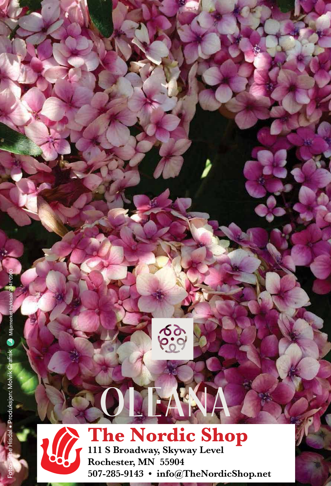
• Produksjon: Molvik Grafisk • Miljømerket trykksak 2041-0960