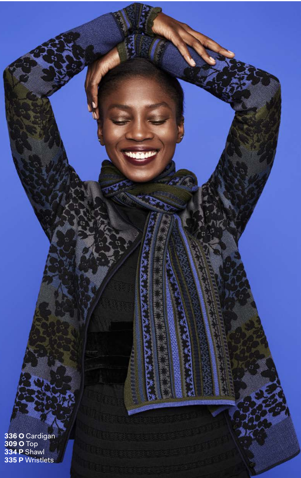
336 O Cardigan 309 O Top 334 P Shawl 335 P Wristlets