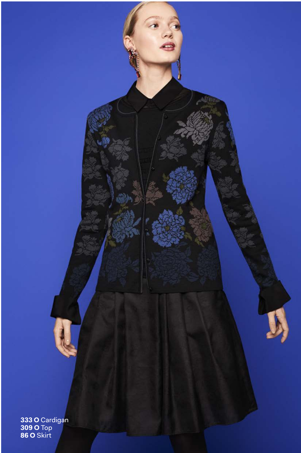
333 ○ Cardigan 309 ○ Top 86 ○ Skirt