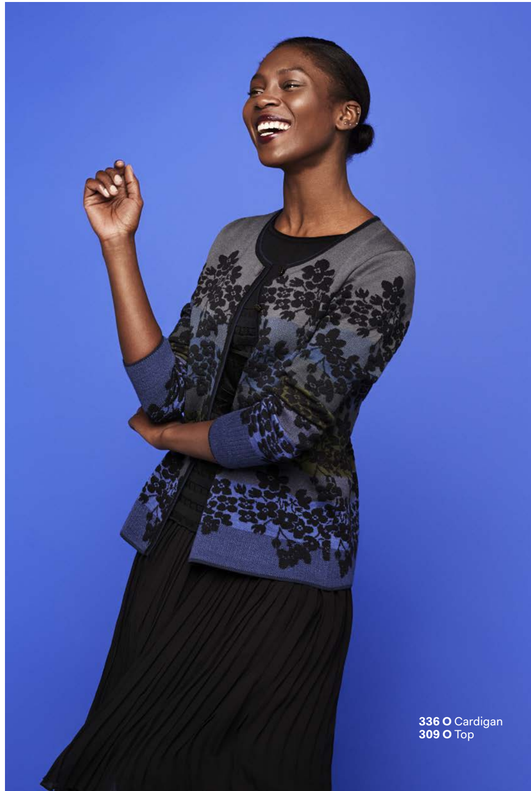
336 O Cardigan 309 O Top