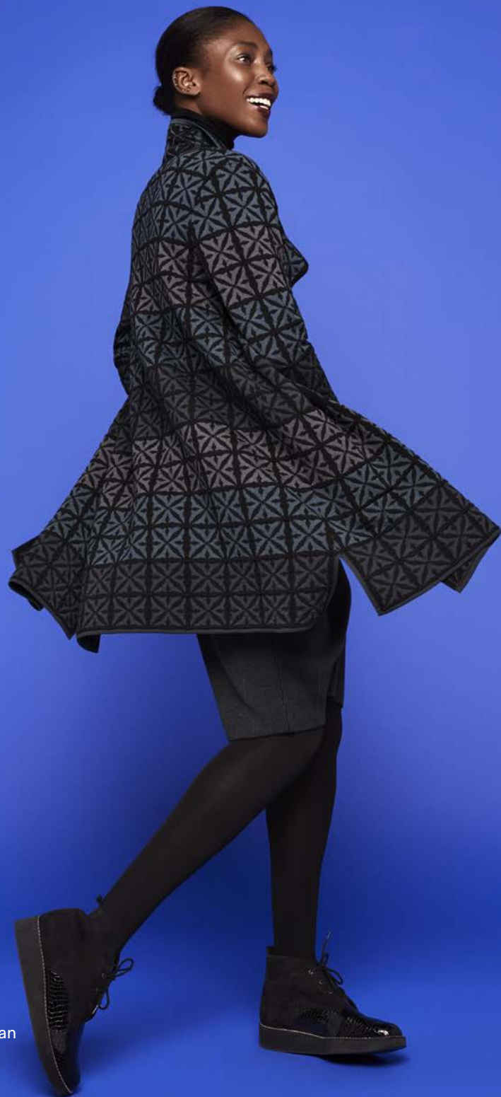
338 O Cardigan 321 O Skirt