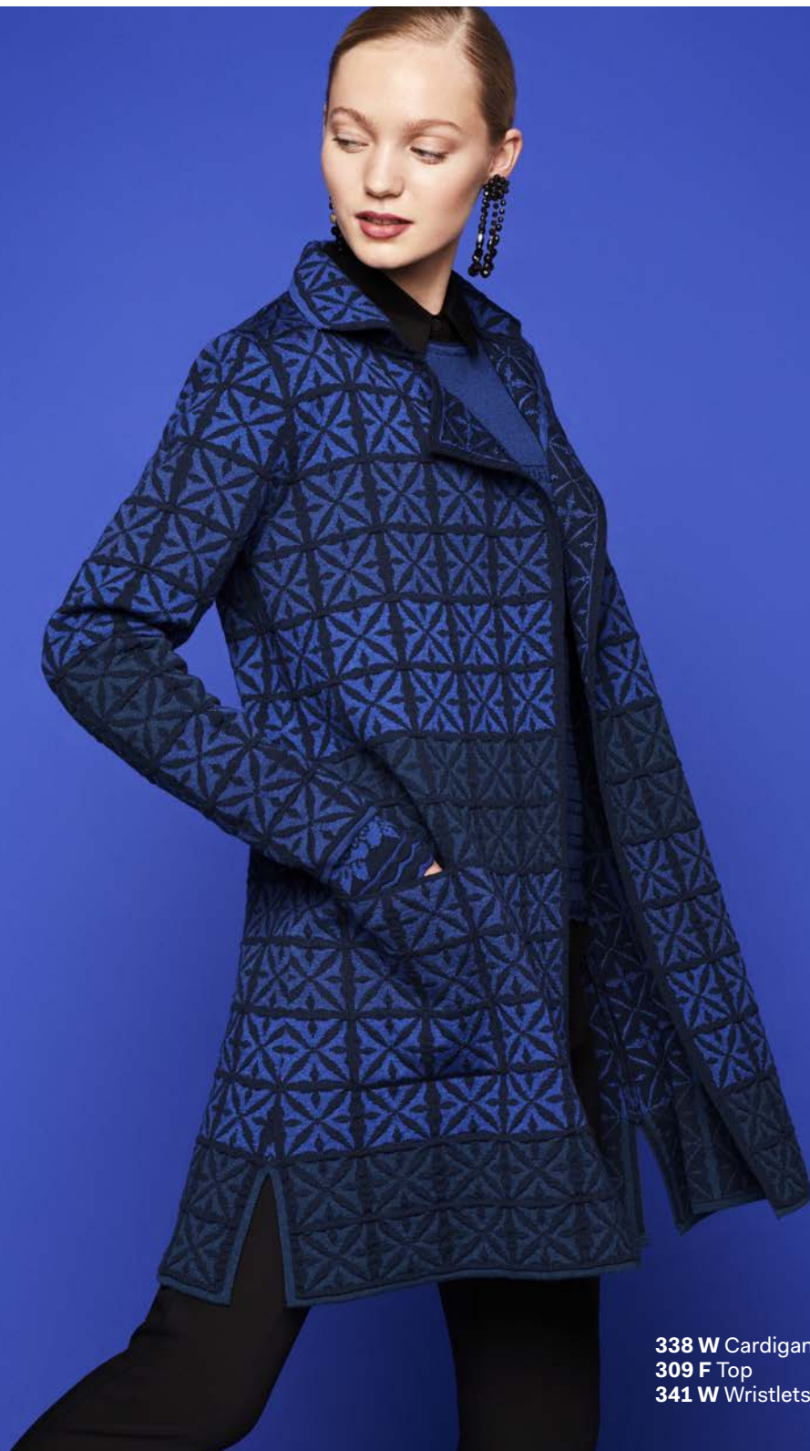
338 W Cardigan 309 F Top 341 W Wristlets