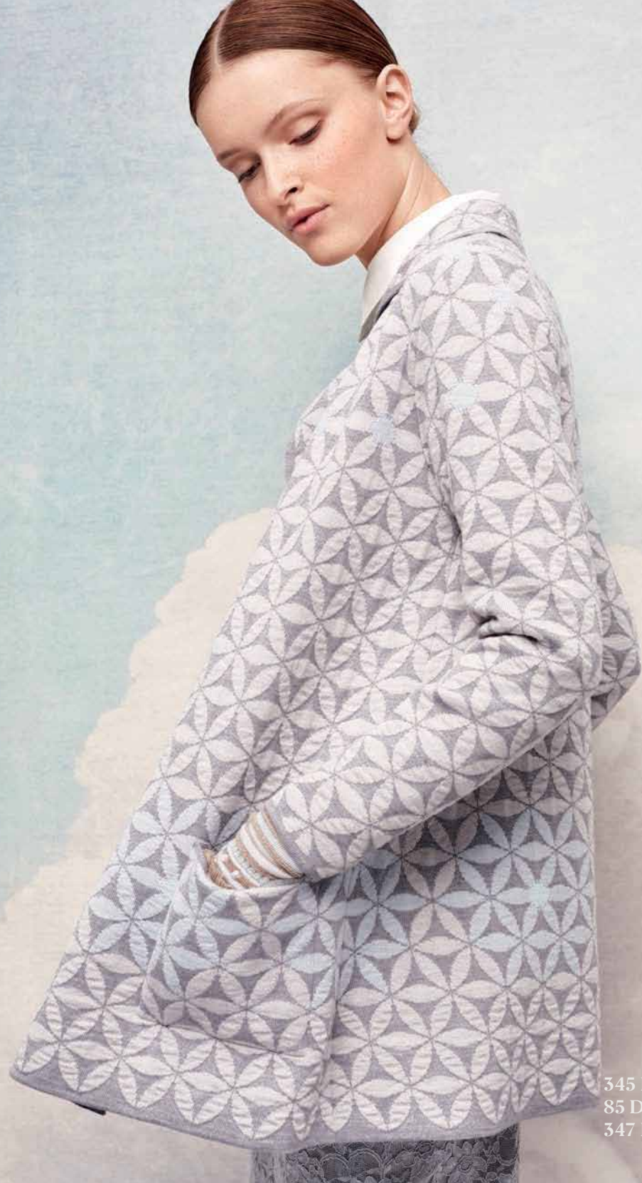
345 D Cardigan 85 D Skirt 347 B Wristlets