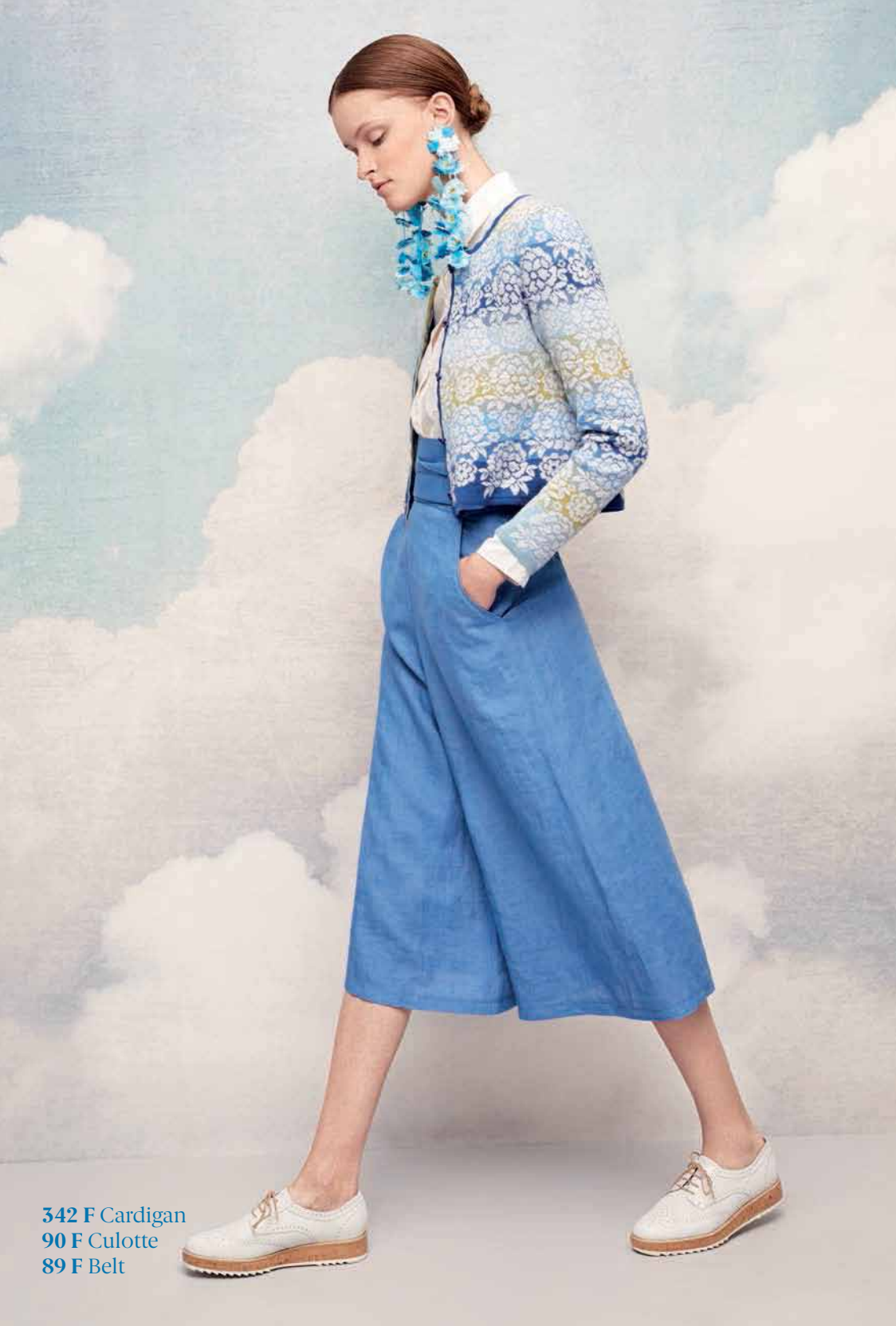
342 F Cardigan 90 F Culotte 89 F Belt