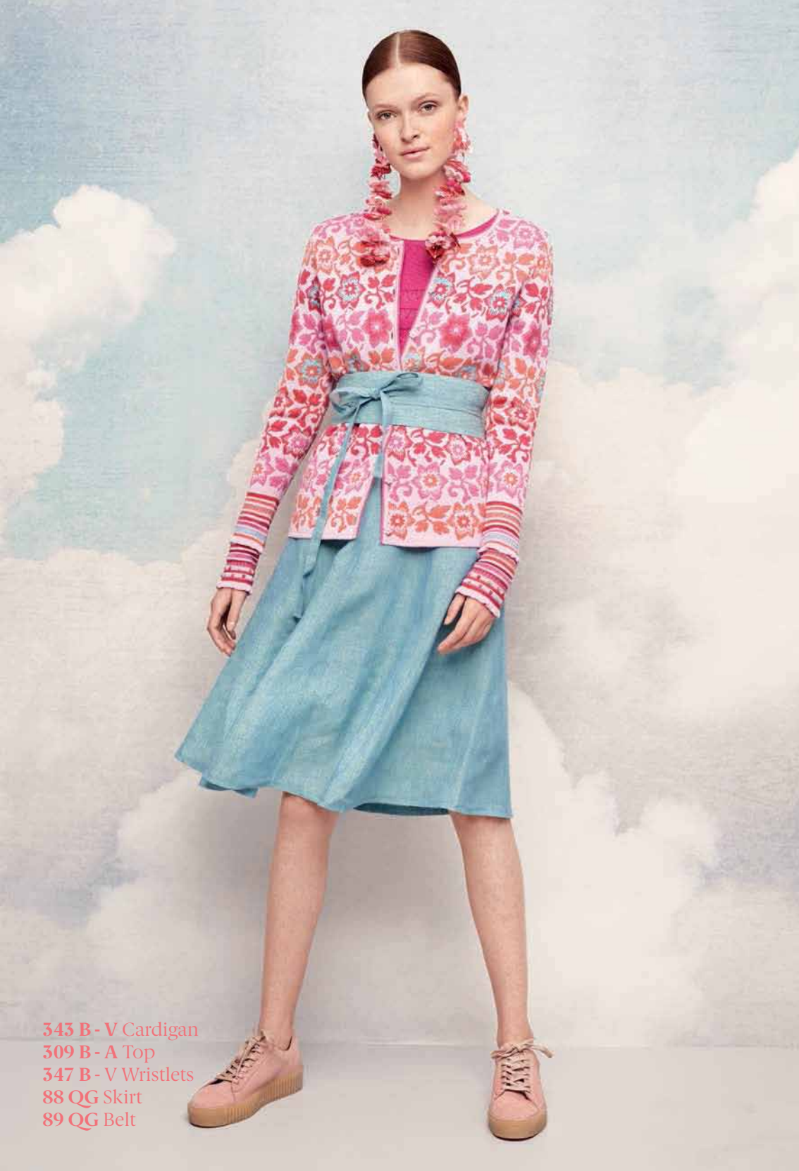
343 B - V Cardigan 309 B - A Top 347 B - V Wristlets 88 QG Skirt 89 QG Belt