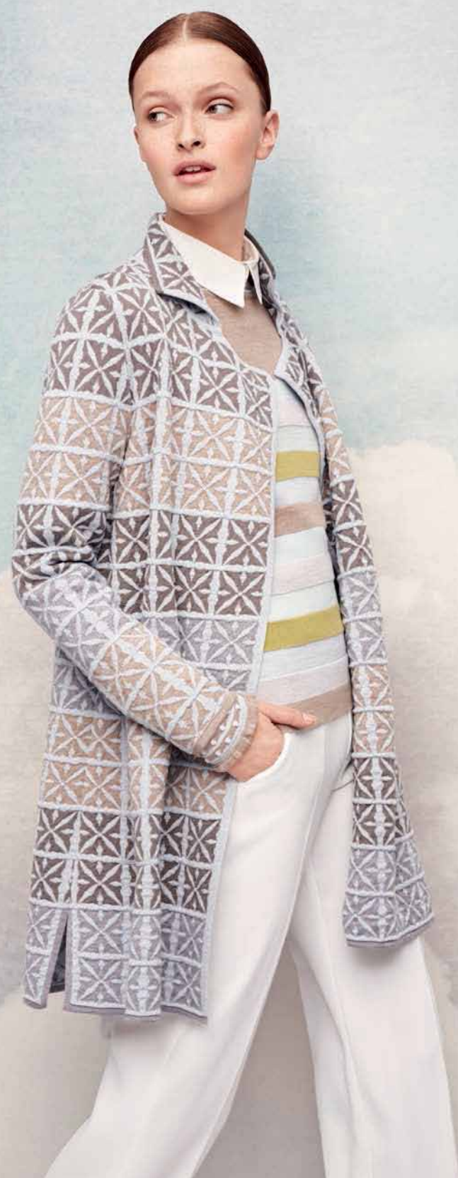
338 BQ Cardigan 310 B Top 347 B Wristlets