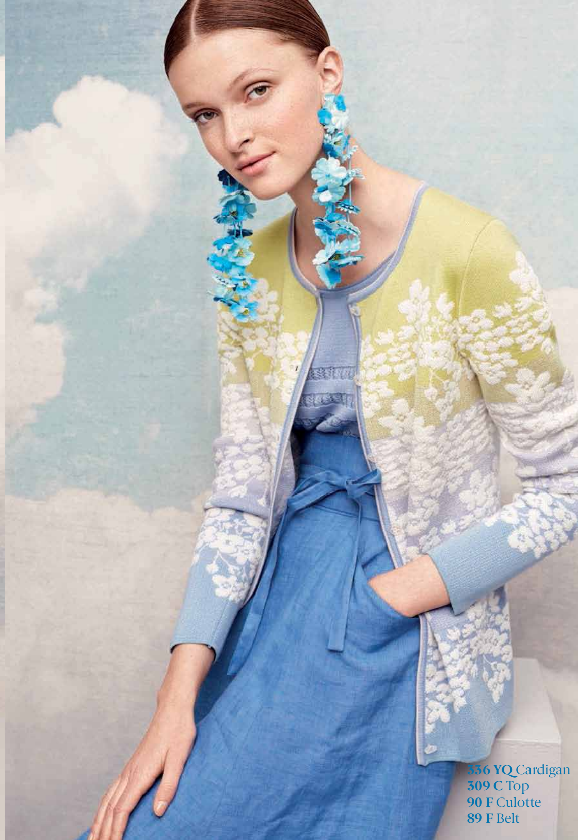
336 YQ Cardigan 309 C Top 90 F Culotte 89 F Belt