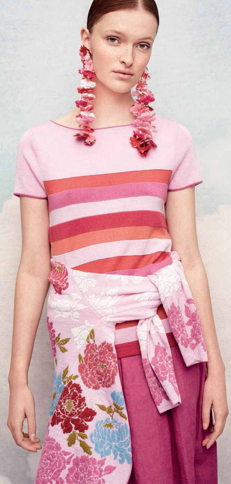
333 V Cardigan 310 V Top 347 V Wristlets 88 K Skirt