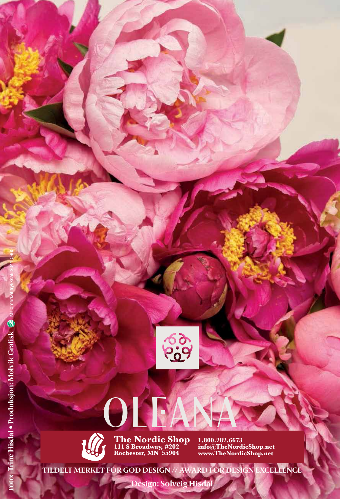
Foto: Trine Hisdal • Produksjon: Molvik Grafisk • Miljømerket trykksak 204 0960